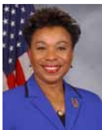
Barbara Lee (United States)