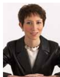
Shereen El Feki (Egypt)