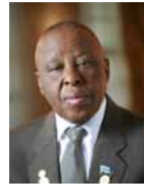
Festus Gontebanye Mogae (Botswana)