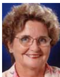
Dame Carol Kidu (Papua New Guinea)