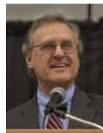
Stephen Lewis (Canada)