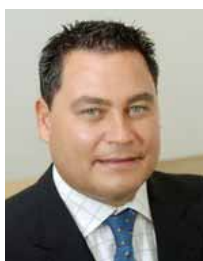
Charles Chauvel (New Zealand)