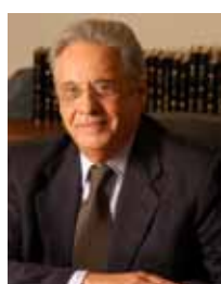
Fernando Henrique Cardoso (Brazil)

The life experiences of the Commissioners gave them a formidable ability to access a wide cross-section of society. This means they are well placed to influence change on complex issues that require the engagement of multiple stakeholders across a range of sectors.