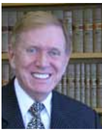
Michael Kirby (Australia)